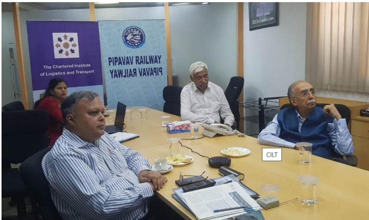
Inauguration of Training Program on 14 May 2022